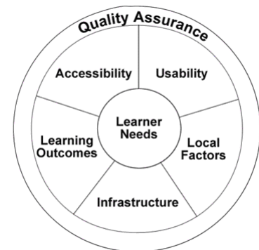
Figure 1: Holistic Framework For E-Learning Accessibility

As well as the flaws in the WAI model, the WCAG guidelines themselves are flawed. Kelly et al (Kelly, 2004) have argued that the poor level of compliance with WCAG guidelines which has been observed in many sectors (including higher education, museums and even disability organisations themselves) reflects, not necessarily a lack of motivation to support users with disabilities but rather a failing in the guidelines themselves. In the light of these issues the authors feel that a slavish commitment to WAI guidelines is inappropriate and that an alternative approach is needed. A holistic framework for e-learning accessibility has been developed by Kelly et al (2004) which takes a user-focused approach to Web accessibility, rather than the conventional checklist approach. This framework is illustrated in Figure 1.