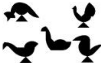
Figure 2: Tangram Metaphor

This work was extended to consider how a more holistic approach to accessibility could be implemented beyond education, where theory and practice in e-learning as a means of enhancing traditional learning approaches had promoted a culture of collaborative, blended approaches to provision of information and experiences. The Tangram Model (see Figure 2 ) was developed to attempt to visualise the approach of using WCAG as one of a set of tools and techniques all aimed at using the Web as a tool to maximise access to information and services (Sloan et al 2006). Other such tools might include use of personalisation of delivery based on knowledge of a user's access requirements, as promoted by the IMS AccessForAll approach to accessibility (DCMI 2008), or even other, potentially more effective media streams to optimise accessibility for particular groups (Carey 2005).