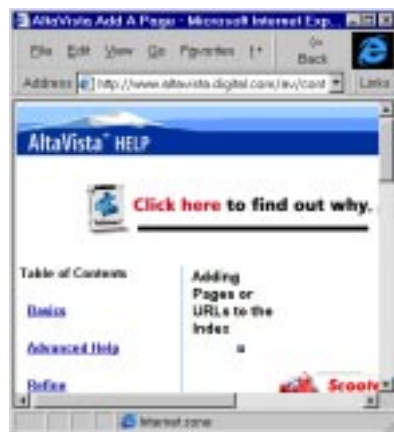
Figure 2 Adding A Resource

Enter a URL of a resource on your website.