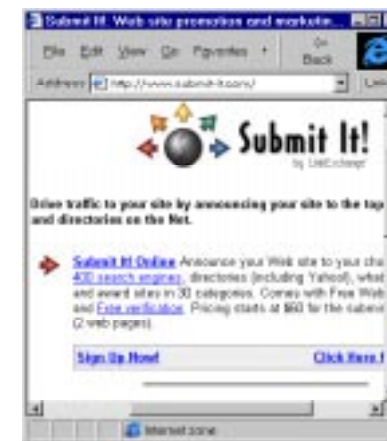
Figure 4 The Submit It! Service

Read the information about the Submit-It! service.