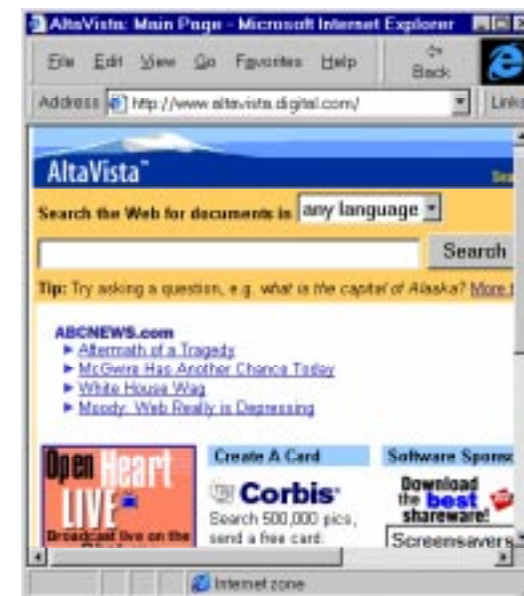
Figure 1 The AltaVista home page

The AltaVista home page shown in Figure 1 will be displayed.