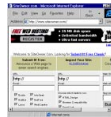
Figure 5 The SiteOwner Service

Enter the URL of a resource on your website.