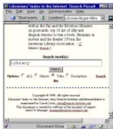
Figure 3 Excite Home Page

Do you think that you should add your details to the form?