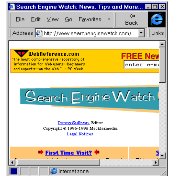
Figure 1 The SearchEngineWatch Home Page