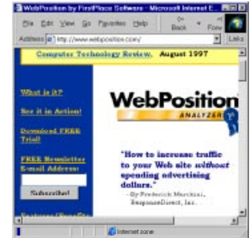
Figure 3 The WebPosition Home Page

Will you download an evaluation version of the software?