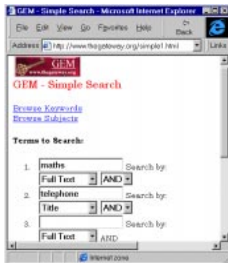
Figure 3 Refining the Search