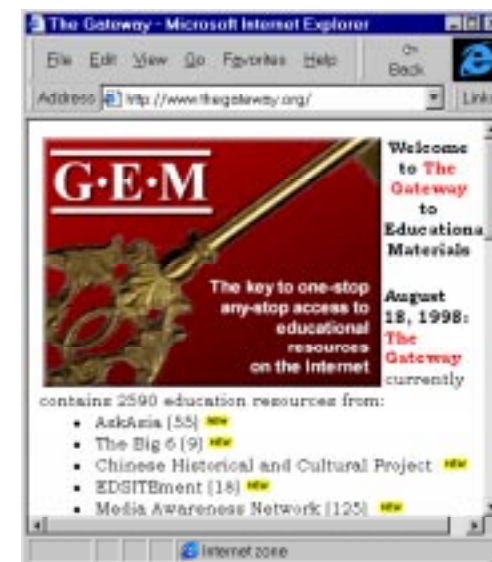
Figure 1 The GEM Home Page

View the list of the Gateway Collections.