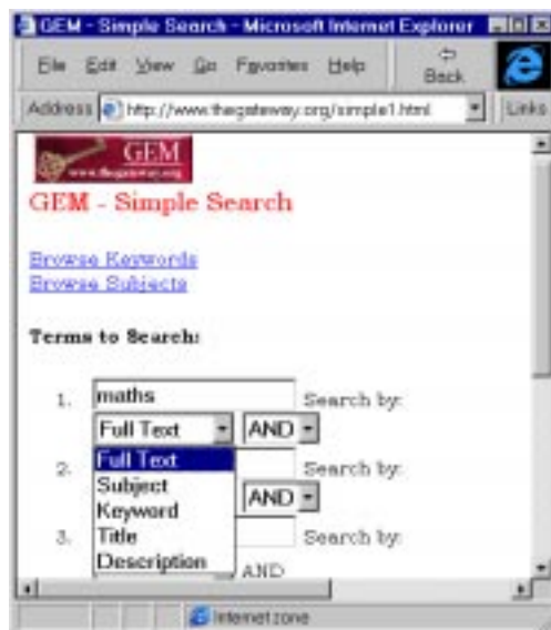
Figure 2 The Search Interface